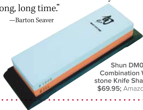
Shun DM0708 Combination Whetstone Knife Sharpener: $69.95; Amazon.com