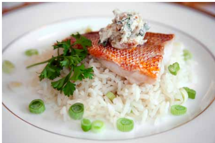
Photography and Styling by Isa Salazar