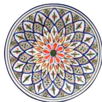
Tabarka Dinner Plate: $45.86 (set of 4); Restaurant Bar Furniture

"A reliable kitchen timer is essential while cooking. We love this timer by Bengt Ek Design."