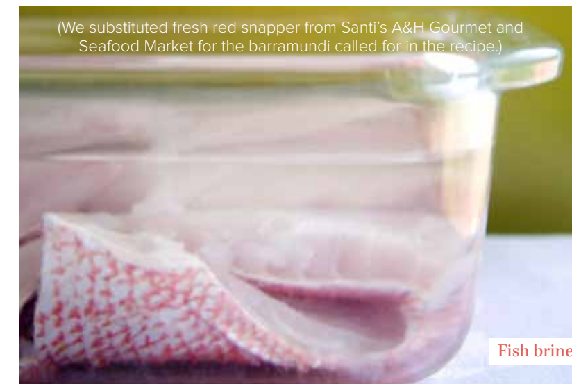
(We substituted fresh red snapper from Santi's A&H Gourmet and Seafood Market for the barramundi called for in the recipe.)

The almond butter pairs nicely with all kinds of fish