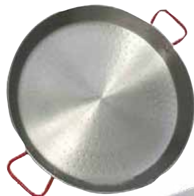
12 Inch Brushed Steel Paella Pan: $19.56; Spanish Feast

"A paella pan is a great tool for cooking rice-based seafood dishes. It captures the flavor of the seafood and it's great for feeding large groups of people."