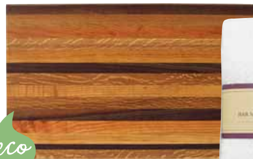
Rustic Cutting Board: $75; Delia Sophia's Handmade Wood Cutting Boards