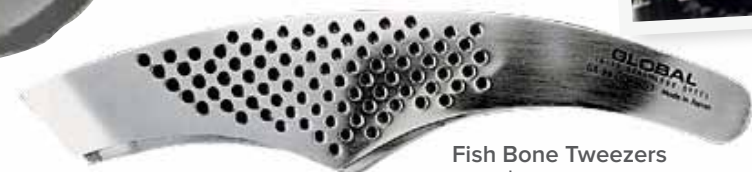
Fish Bone Tweezers by Global: $42.95; Cooking.com