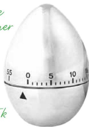
Bengt Ek Egg Timer: $25.27; Scandinavian Design Center

"A reliable kitchen timer is essential while cooking. We love this timer by Bengt Ek Design."