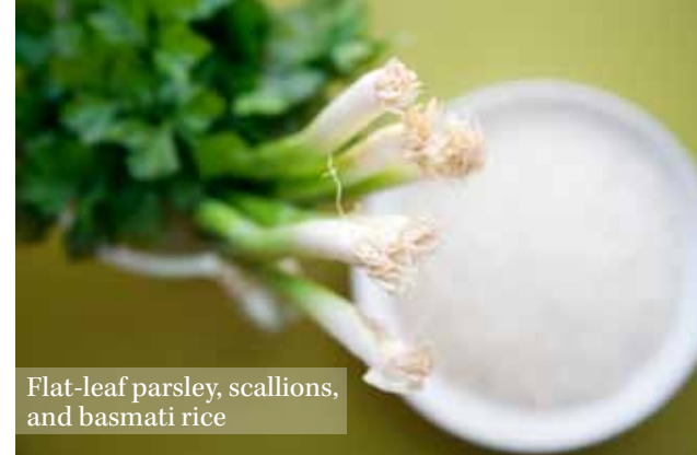
Flat-leaf parsley, scallions, and basmati rice