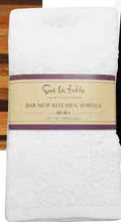
Bar Mop Towels: $7.95 (set of 4); Sur La Table