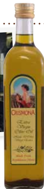
Crismona Extra Virgin Olive Oil: $14.99; Spanish Feast